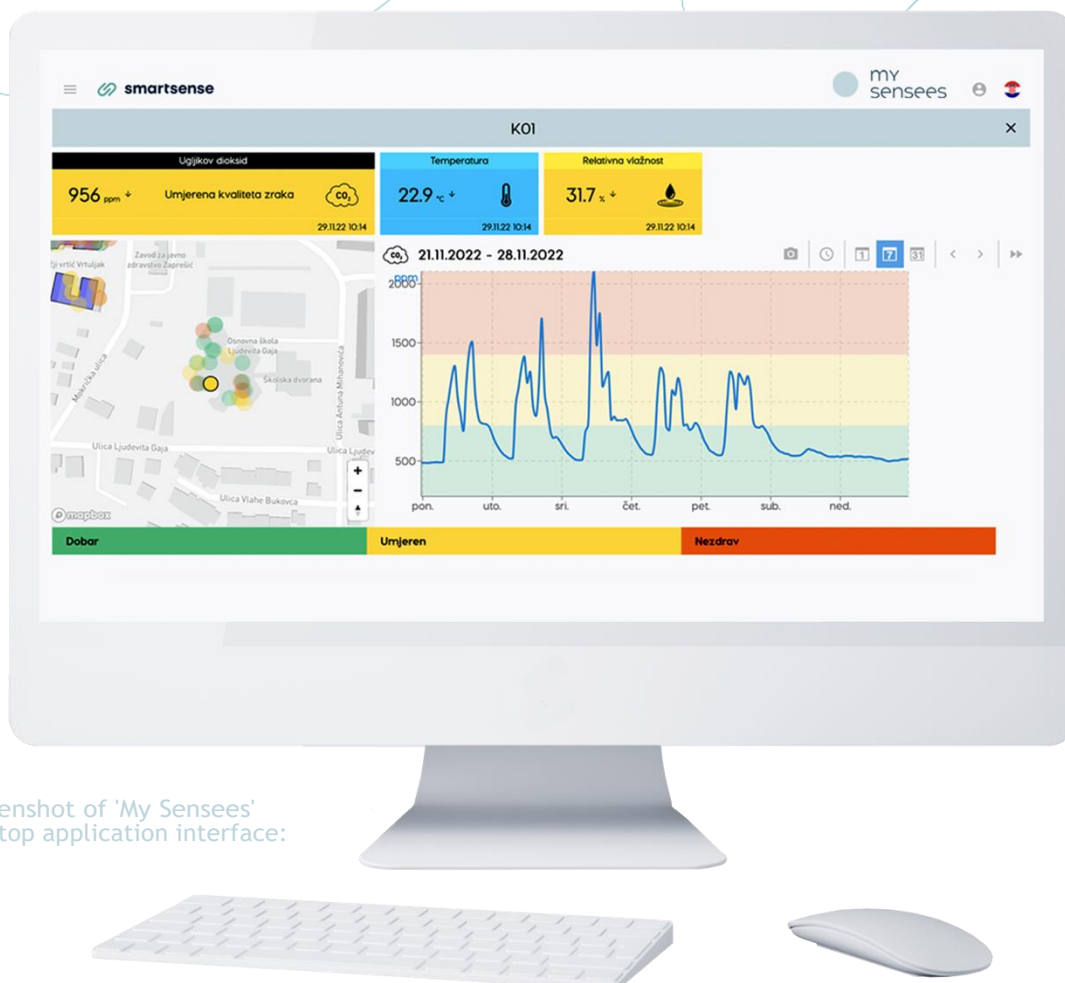
Screenshot of 'My Sensees' desktop application interface: