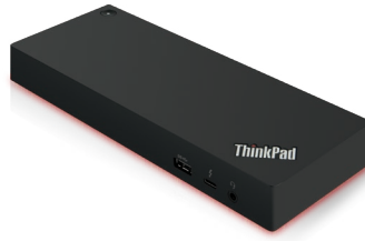
ThinkPad® Thunderbolt™ Workstation Dock