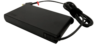
New Slim ThinkPad® 230W AC Adapter