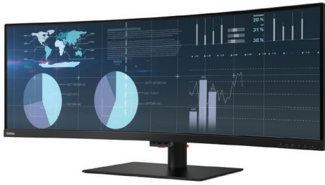
ThinkVision® P44w Monitor