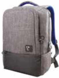
Lenovo On Trend Backpack