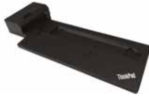
ThinkPad® Pro Docking Station