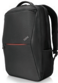
ThinkPad® Professional 15.6" Backpack