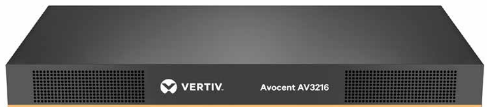
Avocent AV3108 and AV 3216 KVM switches are designed for local and remote management of server resources.

In high security environments, CAC support with encryption for smart cards and password protection for local users, provides security you can depend on for your virtual media sessions. Encryption options include 128-bit SSL, AES, DES and 3DES and they can be selected for keyboard, mouse and video signals and virtual media sessions.