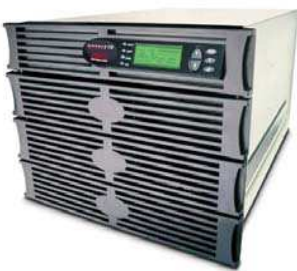
SYH6K6RMI, (Single phase 230V)

APC Symmetra is an on-line double conversion unit and takes advantage of the paralleling capability to offer expansion and redundancy within the system by using multiple power modules. The Symmetra offers outputs from 2kVA to 6kVA (1.4kW to 4.2kW) plus redundancy with a facility to add additional battery strings to increase the system run time.