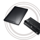
ThinkPad® Tablet Dock