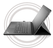
ThinkPad® 10 Folio Keyboard