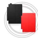
ThinkPad® 10 Quickshot Cover