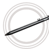
ThinkPad® Pen Pro