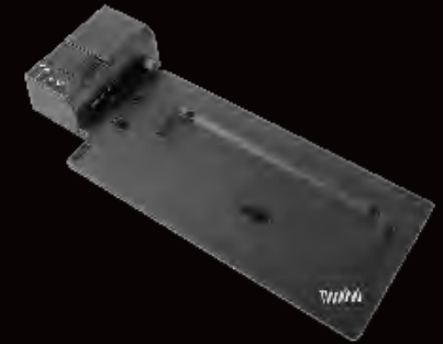
ThinkPad Pro Dock ▶