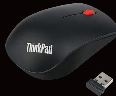
◀ ThinkPad Essential Wireless Mouse