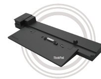
ThinkPad® Performance Dock